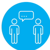
WELLBEING OF STAFF & CUSTOMERS