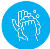
HYGIENE & CLEANING